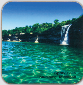
Produced with: EMULATE™ Dye Sublimation Paper