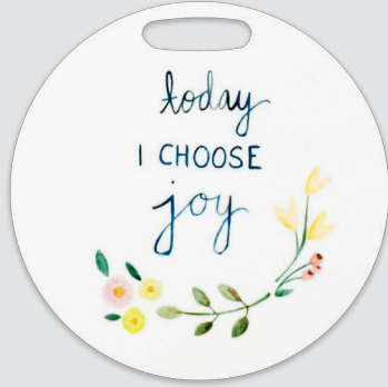
Produced with: EMULATE™ Dye Sublimation Paper